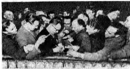
18. The match in ended